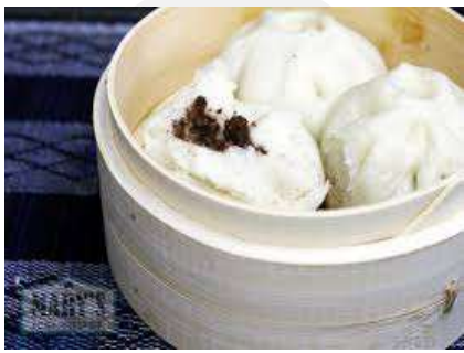
Sweet Bean steamer

Daily there will be various themes which will attract the guests and the surrounding market