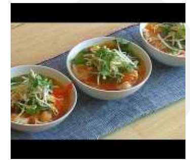
Noddle and Dumpling soup